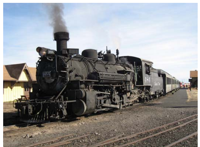
Train and balloon photos courtesy Linda Barron

Ascension. Like a flame just before it falters, the colors were vibrant and lit the morning sky. Slowly we began leaving the park and heading for our next adventure or home. The 'afterglow' of the trip will remain for a long time.