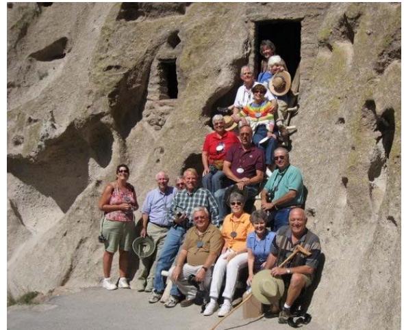
Group at Bandliere NM Pueblo.

Fireworks. Sunday, October 15 was the final day of the Balloon fiesta and caravan. It seemed so long since we first gathered in Santa Fe. We were a family now and parting is always difficult. Sweet rolls were provided and we sat in the cool morning air and watched the Farewell dawn patrol and Mass