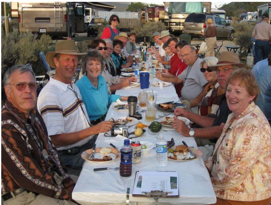
Red Team serves dinner in Taos

By 8:45 on day 5 all diesel motors were humming and rearing to get on the road to Taos. The mechanical wizardry of Wayne McCray helped all coaches to depart, in waves and on time! We arrived at Taos just in time to carpool to the feast of San Geronimo at the Taos Pueblo. After tasting some of the Pueblo's delicacies, watching pole